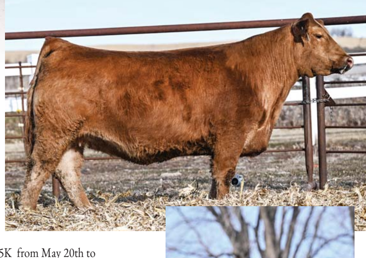
Son of LVLS Jazmine 193I

Superior genetics, superior design and superior quality- this is one hot donor prospect if we've ever seen one! LVLS Jazmine 193J is a 68% Lim-Flex daughter of COLE Fortune 12F. He is the COLE Cadillac 05C son out of an AHCC Xpense Account X516 daughter, COLE Miss Austin 3157A. This female's dam, LVLS Grade One Fever 193G is an ELCX Cabin Fever 273C female. Numerically, LVLS Jazmine ranks in the fifth percentile for her milk figure and in the 15th percentile for her birthweight figure. She is feminine in her design, tremendous in her structural build and ultra smooth made. An unequivocal standout for the donor lineup in anyone's breeding operation! She is double polled and red.